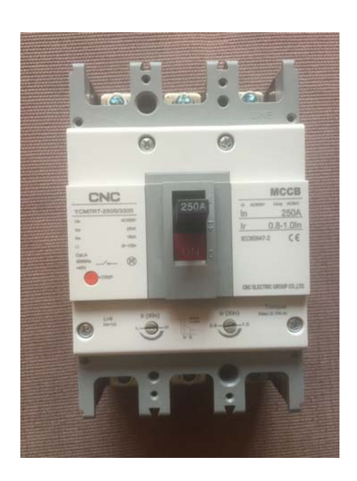
- End of Test Report -