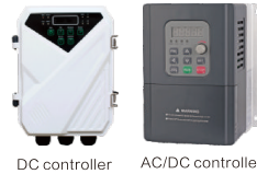
DC controller AC/DC controller