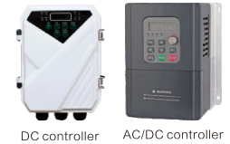
DC controller AC/DC controller