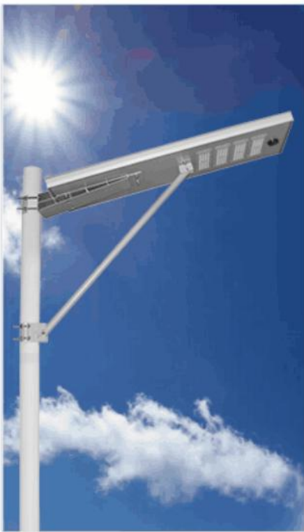
Sun charging in daytime