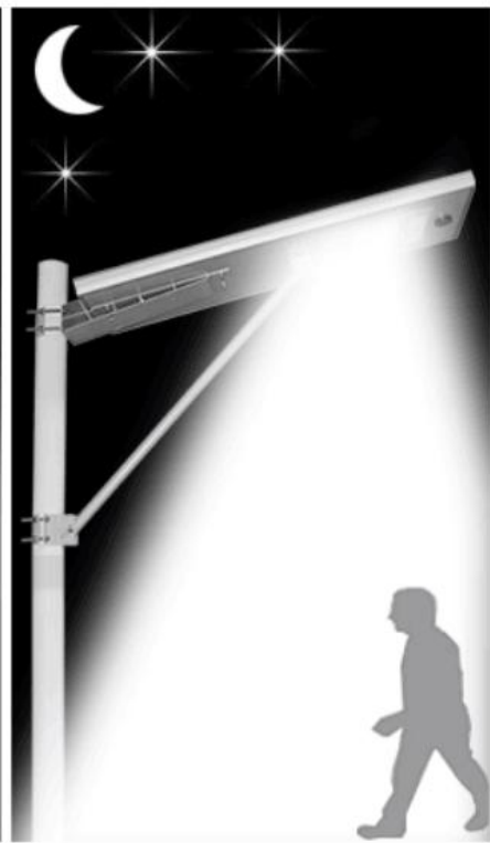
When people close 100% brightness