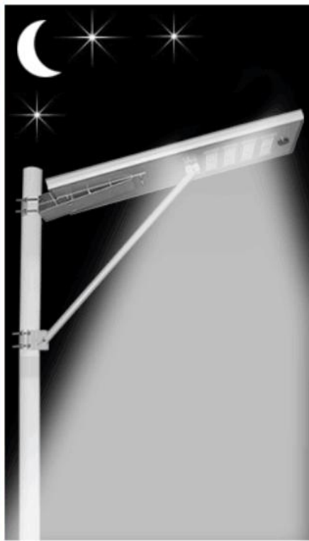
When people leave 50% brightness