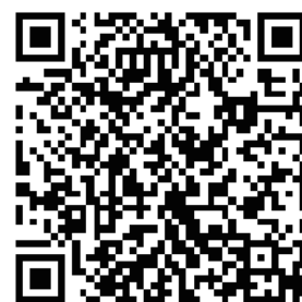
Android & iOS

Sacolar can manage to deliver a satisfactory monitoring solution based on PVguarder server. PVguarder provides access to key system datas at anytime and any place.