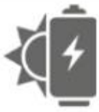
LITHIUM BATTERY CHARGING UNIT