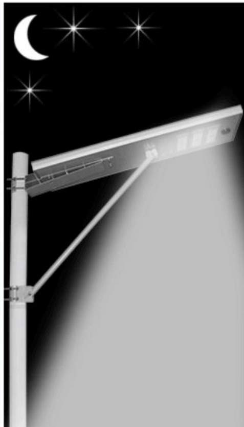
When people leave 50% brightness