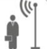
SMART MOTION SENSOR