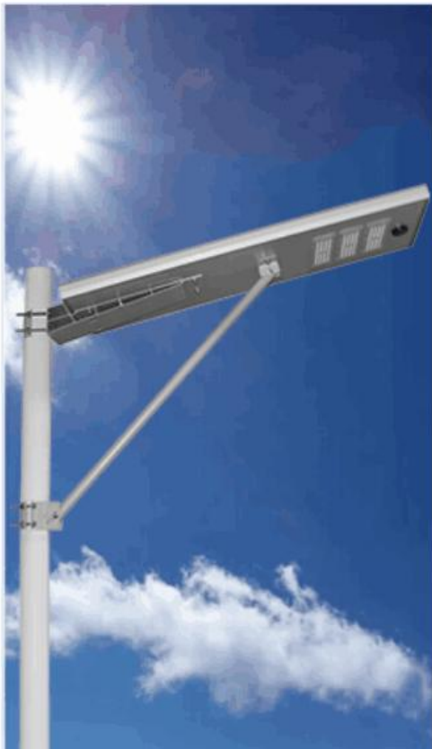
Sun charging in daytime

Infrared detection controller, the use of infrared detection method to control the load switch.