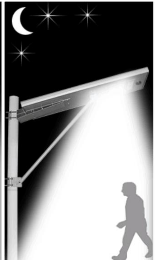
When people close 100% brightness